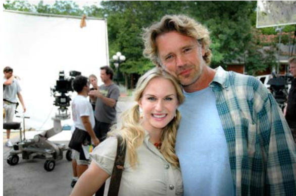
Jenn Gotzon and John Schneider in Doonby .

Jenn Gotzon has to be one of the busiest young Christian actresses we know. She is helping promote a new film you will read about here, Doonby , and recently finished work on Alone Yet Not Alone .