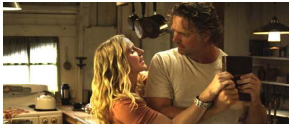
Scene from Doonby

Ed.: We were pleased to be put in contact with you through mutual friends. We find a favorite subject of yours is a film you have coming out Spring of 2011, Doonby . It has a very intriguing title. What is that about and what is your role?